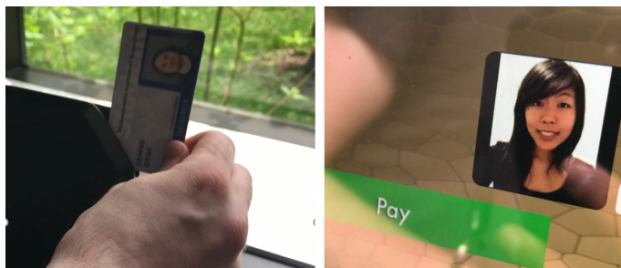
Figure 1: Left : Dennis swiping his MIT ID card with modified track information at a card reader. Right : Linda’s image being displayed after Dennis’s swiped card.

the magnetism of iron-based particles [3]. However, the data is static and cannot be dynamically altered to respond to queries from a terminal (ex. even in cases of unauthorized access). As a result, magstripe cards have security analogous to handwritten notes on a sheet of paper. The static data can be written to and read from by anybody with an inexpensive ($20) skimmer. Furthermore, an adversary can write this data to a blank card and create an effective clone for slightly more ($60). [2].