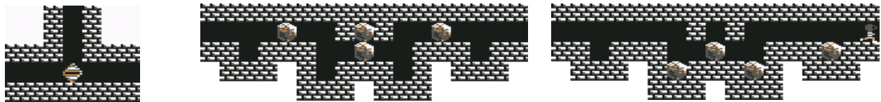
Figure 1: (Left) location traversal, (center) single-use path gadgets for Boulder Dash. (Right) Single-use gadget after traversing from left to right.

The conclusion is that Boulderdash is NP-hard.