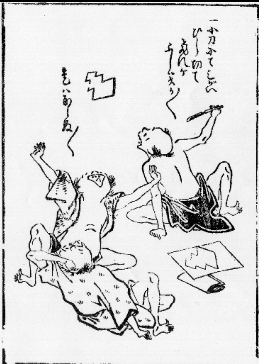
Wakoku Chiyekurabe — Kan Chu Sen, 1721