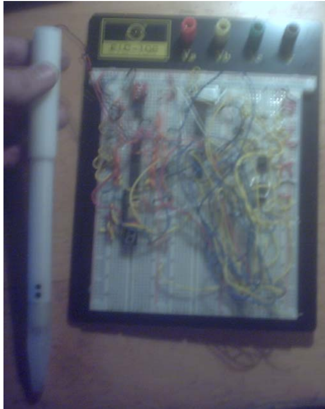
Figure 2: Sensor prototype and controlling electronics

record the date, time, latitude, and longitude of each measurement. In addition, the GPS may be useful as a non-volatile memory, however, this has not been verified as of yet. An LCD screen will be used to interact with the user, providing a calibration interface, a display of individual measurement information, as well as the results of formulae computed by the controller that characterize the water penetration and distribution for a set of samples.